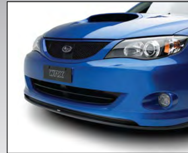
STI Front Lip Spoiler STI Front Lip Spoiler gives Impreza a mean, ground-hugging attitude. E2410FG100 Not compatible with Front Underspoiler

Front Underspoiler Enhance the good looks of your Impreza with a color-matched Front Underspoiler. Not compatible with Front Underguard or Front Lip Spoiler