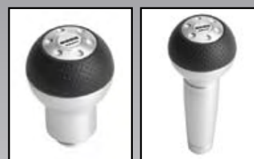
5 M/T A/T