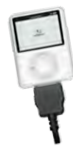
Details at www.subaru.com/ipod

Allows extensive control of your iPod through the vehicle's head unit and steering wheel controls (if equipped). Text displays playlist, artist, album, and song information. Charges your iPod and supports Podcast and Audiobook content. H621SSC200 Not compatible with Satellite Radio