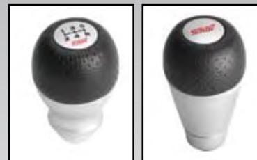
5 M/T A/T