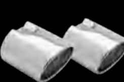
Dual Exhaust - 4D

Polished stainless steel exhaust tips add a finishing touch to the back of your Impreza. D0510FG020 (4-Door - 2 required) D0510FG010 (5-Door) D501SFG000 (5-Door 2.5GT)