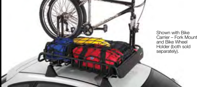
Shown with Bike Carrier - Fork Mount and Bike Wheel Holder (both sold separately).

Heavy-Duty Roof Cargo Basket Constructed of powder-coated steel. Includes mounting hardware, black stretch net with hooks and a custom fairing to help deflect wind and reduce noise. Measures 44" L x 39" W x 6.5" H.* E361SSA200 E361SSA100 (Bike Carrier - Fork Mount) E3610LS430 (Bike Wheel Holder)