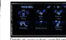
Details at www.subaru.com/bluetooth

† Required monthly subscription sold separately after trial period ends. Additional fees, equipment, and taxes may apply. Not available in Hawaii and Alaska.