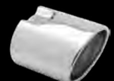
Single Exhaust - 5D